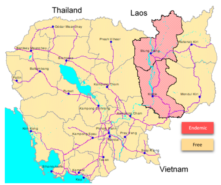
Figure 1: Schistosomiasis mekongi endemic areas

Currently there are 56 villages in 2 districts of Kratie province and 58 villages in 5 districts in Stung Treng province with an estimate of 80,000 people at risk (50,000 of whom are in 56 villages in two districts of Kratie and 30,000 in 58 villages in five districts of Stung Treng province). Peak Transmission period (February-April) overlaps with fishing season.